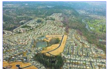
Falling Water, a 450-acre housing development near Bonney Lake, lies on former Weyerhaeuser land. Weyerhaeuser no longer owns commercial timberland in Pierce, King or Snohomish counties.